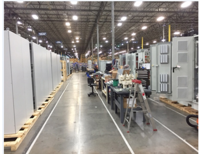
Custom Paned Assembly Area