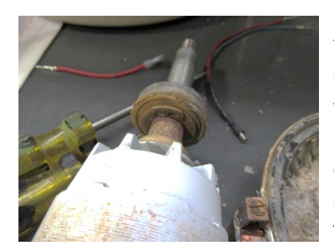
Figure 2: Rust on inboard bearing face that could be prevented by Triple Seal<sup>™</sup> Protection

Regal<sup>®</sup> Centurion<sup>®</sup> PRO motors now feature the new Triple Seal<sup>™</sup> Protection designed into the pump end of the motor to protect the bearings from water, pest and debris, extending the life of the motor. Triple Seal Protection was developed to combat premature motor failures associated with pump end bearing failures due to water ingress. Triple Seal Protection is a robust design that protects the pump end bearing on both the outboard and inboard (see figure 2) facing seal of the bearing.