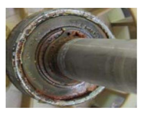
Figure 1: Rust on bearing face is a sign of water intrusion

Replacing and properly installing the pump motor with a high quality seal and ensuring that there are no leaks in the plumbing will maximize the life of a pump motor. Keeping the motor free of surrounding debris and in a dry, well-ventilated environment where air can circulate freely will allow the motor to run cooler and extend its life.